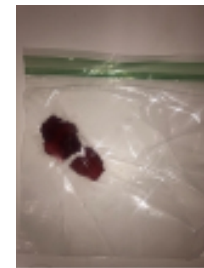
Cannabinoids (% weight)